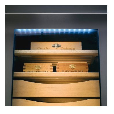
Humidor: Presentation box

Using the precision electronic control system, the temperature can be set between +16 °C and +20° C. The humidity can be set between 68% and 75%, as required. The temperature alarm alerts the user to any irregularities in the inside temperature.