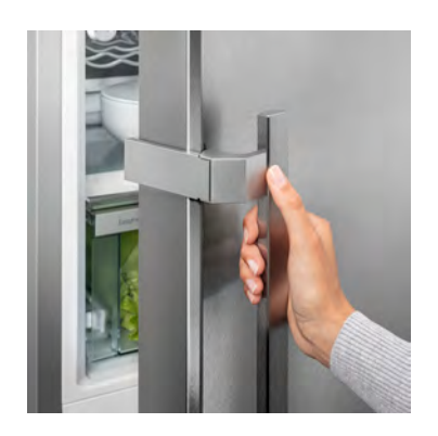
Slimline door handle (with integrated opening mechanism)

The rear wall in elegant SmartSteel gives your Liebherr a stylish look and feel. Your food will also love SmartSteel as stainless steel is food-safe and hygienic. SmartSteel also reduces the visibility of fingerprints – making the appearance even more pleasing.