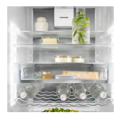
SmartSteel rear wall

Fingertip control: the touch display enables easy and intuitive operation of your Liebherr. All functions are clearly arranged on the display. By gently tapping a finger, for example, you can easily select the functions or check the current temperature of your refrigerator.