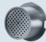
Activated Charcoal Filter Part no.: 988129100