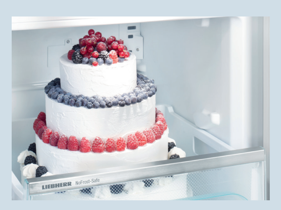
VarioSpace: The freezer includes include drawers and glass shelves that can be conveniently removed to create extra storage space. It's Liebherr's very practical solution to quickly accommodate even bulky items.

Volume, efficiency, economy, ease of use, and outstanding design are the key features of the SGNPes 4365 freezer from Liebherr's BluPerformance series. High-quality components and materials, and perfect workmanship combined with precise touch electronics system are what made this appliance so efficient.