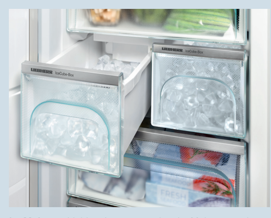
IceMaker: Liebherr's automatic IceMaker produces flawless crescent ice and keeps a constant supply on hand for every occasion.