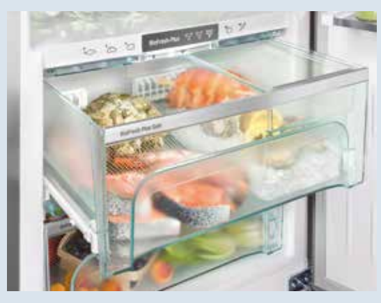
BioFresh-Plus: With the adjustable temperature range of 0°C and -2°C, BioFresh-Plus technology offers even more flexibility for your produce. The BioFresh-Plus drawer includes a versatile Fish & Seafood-Safe.