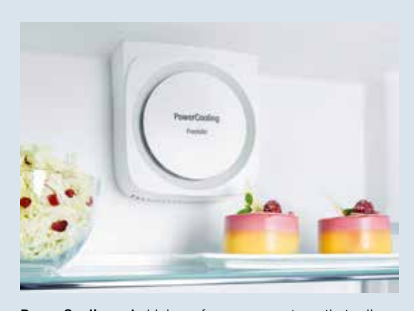
PowerCooling: A high-performance system that allows freshly stored items to be chilled rapidly while maintaining an even temperature throughout the interior. In this energy-efficient BluPerformance range, the fan switches off when the appliance door is opened, saving valuable energy.

Introducing Liebherr's award-winning Side-by-Side model from the BluPerformance range – the SBSes 8486 . This eye-catching unit boasts an array of innovative solutions with six different climate zones, but its multi-temperature wine compartment is what makes it most unique! Enjoy added flexibility with BioFresh-Plus safe which offers an adjustable temperature range of 0°C and -2°C. Comes with a versatile Fish & Seafood-Safe.