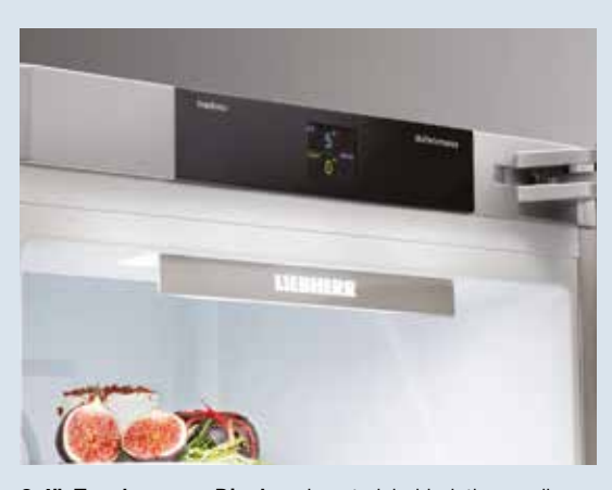
2.4" Touchscreen Display: Located behind the appliance door, this high-resolution and high-contrast 2.4" touchscreen display can be read from any angle. Stored menu options are Intuitive and easy-to-operate.