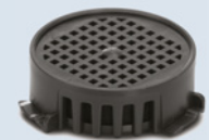
Activated Charcoal Filter Part no.: 988111600