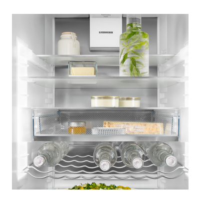
SmartSteel rear wall

The SmartSteel surface makes your highend quality Liebherr a real eye-catcher – and a real piece of designer furniture. The horizontal effect perfectly accentuates the stainless steel and gives the surface a silky gloss, making it pleasant to the touch. The antifingerprint coating reduces the visibility of finger prints and is easy to clean.