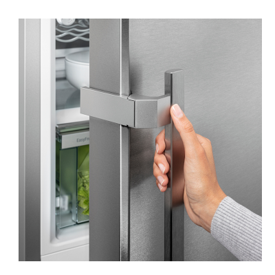
Slimline door handle (with integrated opening mechanism)

The rear wall in elegant SmartSteel gives your Liebherr a stylish look and feel. Your food will also love SmartSteel as stainless steel is food-safe and hygienic. SmartSteel also reduces the visibility of fingerprints – making the appearance even more pleasing.