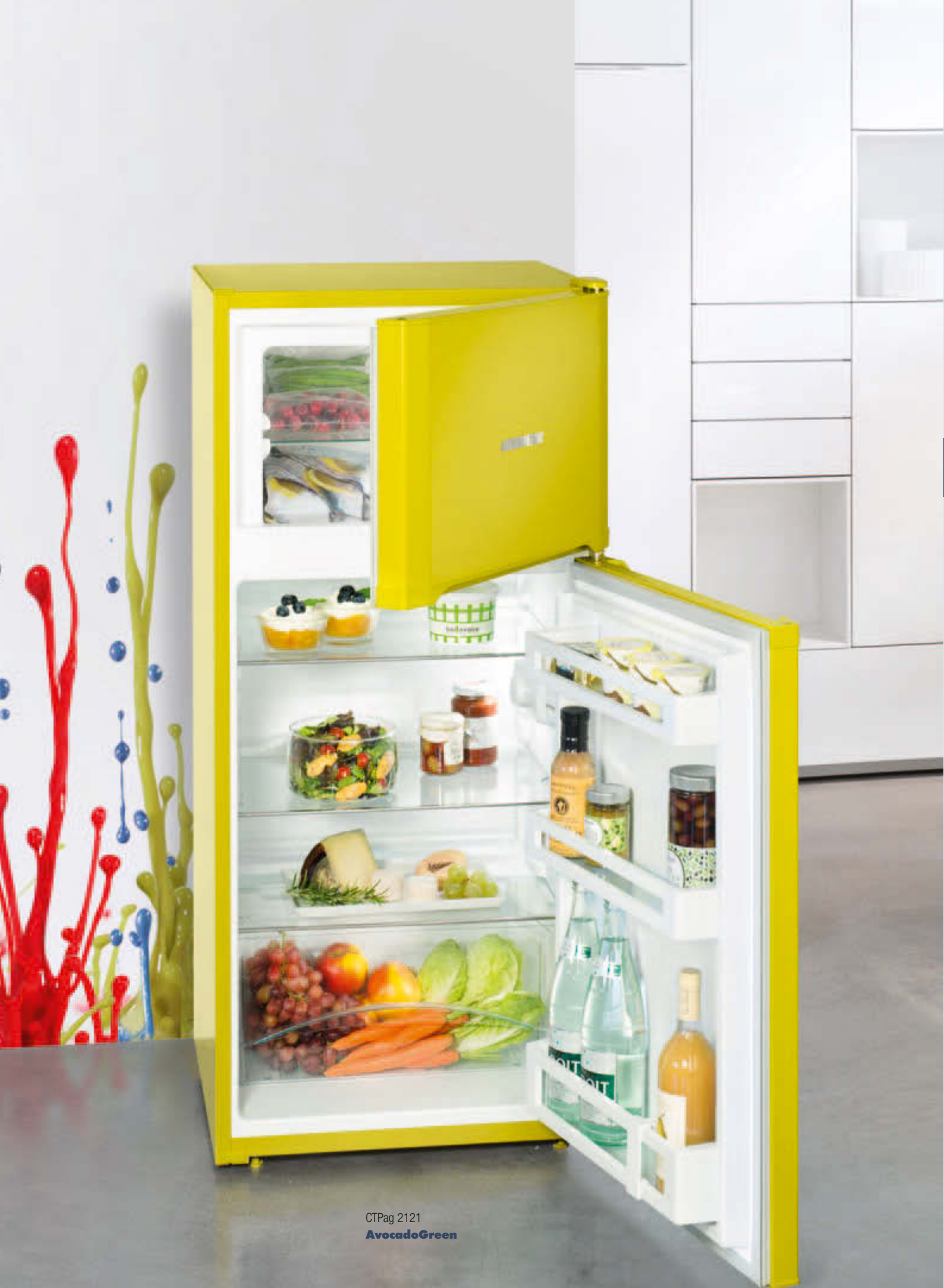
CTPag 2121 AvocadoGreen