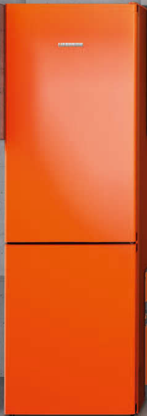
CNno 4313 NeonOrange

Whether you choose a small, compact TopFreezer (from page 10), fridge-freezers with the practical SmartFrost function (from page 6) or with no-more-defrosting convenience (here on the right) - with a ColourLine model from Liebherr you can combine your individual and unique lifestyle with perfect freshness and convenience.