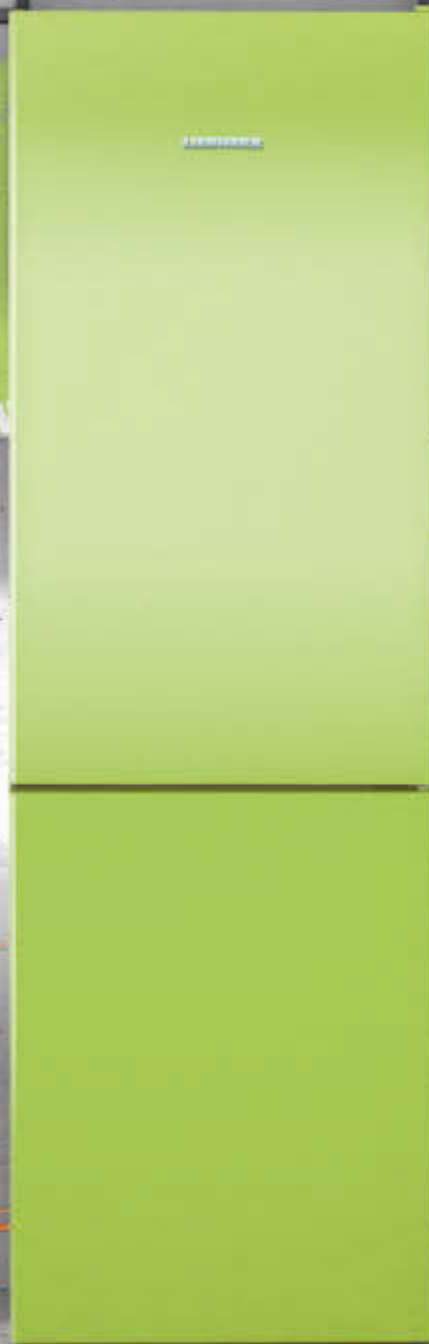
CNkw 4313 KiwiGreen