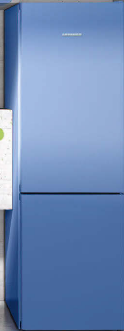
CNfb 4313 FrozenBlue