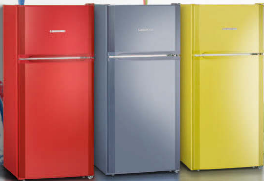
CTPfr 2121 FireRed