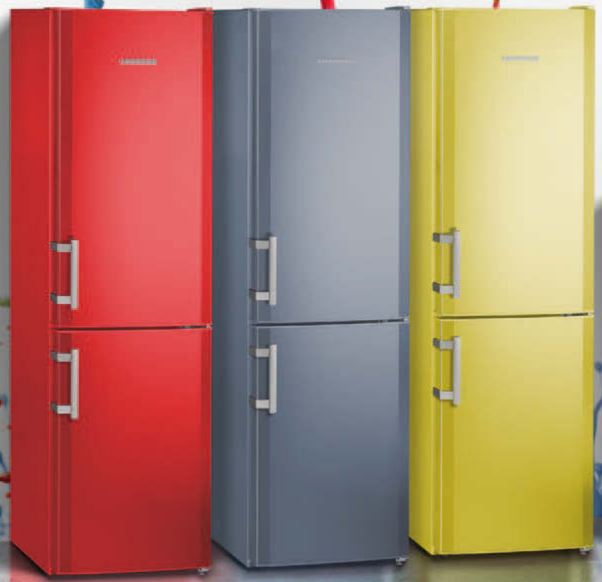
CUfr 3311 FireRed