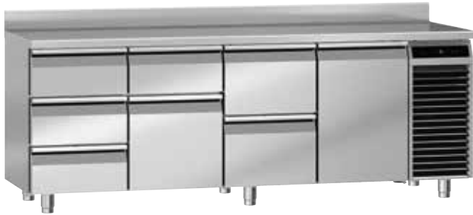
FRTSvlg 7584 S01